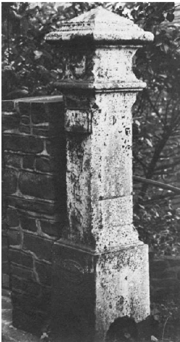
No. 14 - Bug Hill

Showing almost the full height of the post and with the correcting plate intact