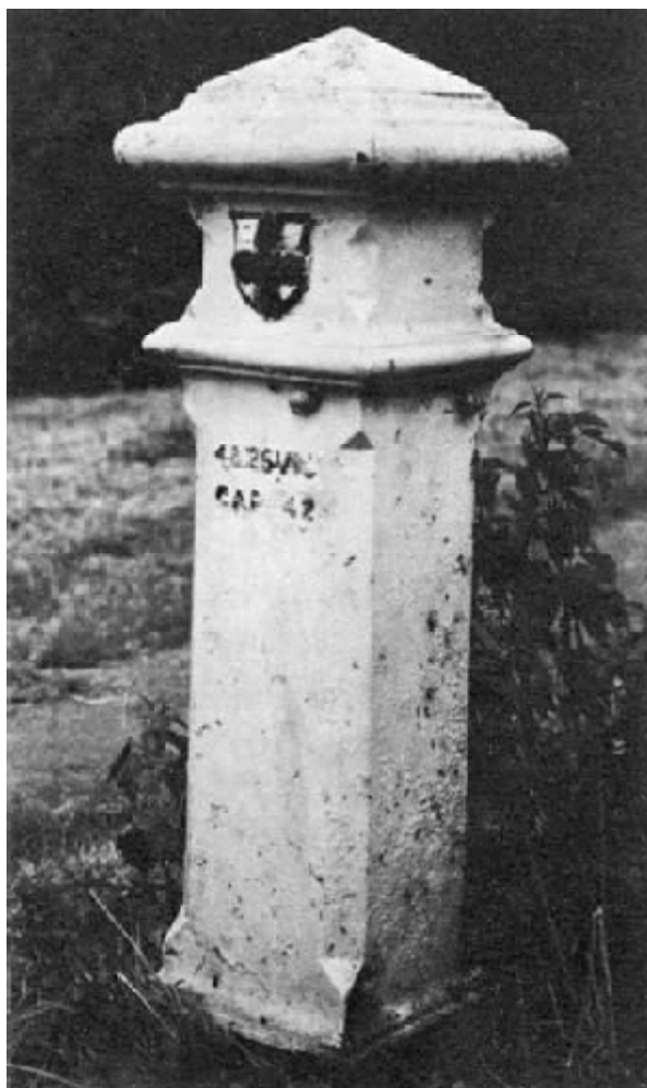
Coal Post (no. 23) at Coulsdon Road

AROUND the Bourne Society's area are a number of cast-iron roadside posts, square in shape, with a pointed top, and about four feet high overall, bearing the arms of the City of London, and the inscription either '24 VICT', '4 & 24 VICT CAP 42', or '24 & 25 VICT CAP 42'. The inscription '4 & 24 VICT CAP 42' was in fact a manufacturing error; it was discovered and rectified in many instances by fixing a correcting plate over the erroneous inscription and bearing the correct '24 & 25 VICT CAP 42'. The plates were fixed with four studs; some survive (e.g. 14. Bug Hill) but many have been lost. On the front of the base, visible where uncovered with earth, is an oval