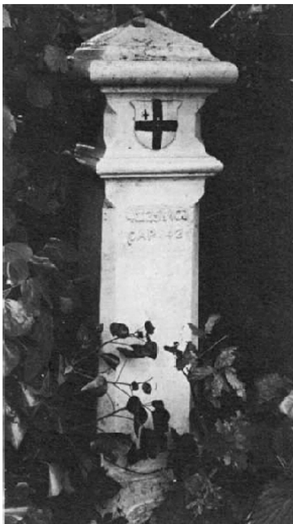
No. 30 - How Lane, How Green

Maker's inscription on base of coal post