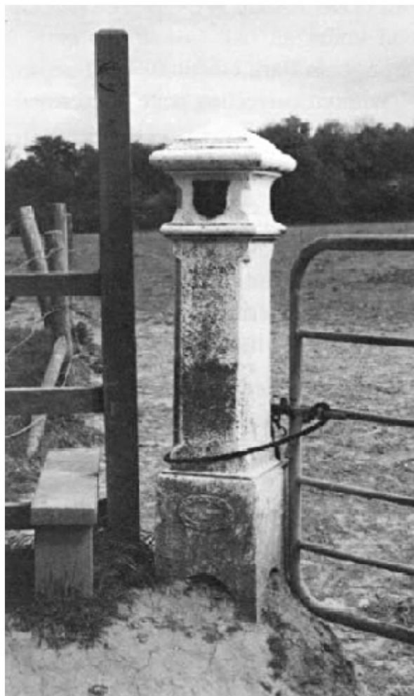
No. 5 - Lane near Scotshall Farm

8. FARLEIGH ROAD AND OLD FARLEIGH ROAD. 365597. At commencement of Old Farleigh Road, just beyond the Harrow Inn in grass verge of Little Farleigh Green a few feet from the road. Well set in earth, and in good condition. City arms on black shield. It appears to have been fitted with a correcting plate, but neither plate nor inscription are now visible.