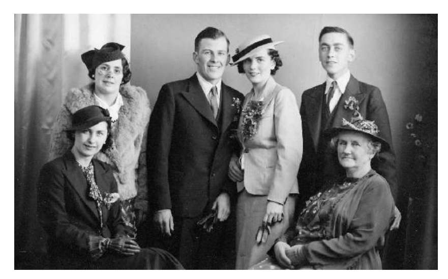
Our Wedding Day 17 April 1936