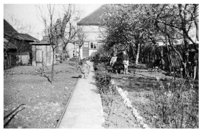
The back garden of 'our half' of 'Plum Tree Cottage' \,-\, 1948