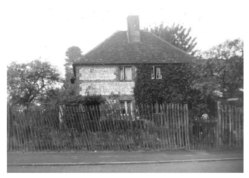
'Plum Tree Cottage' — 1945 Still two cottages – ours on the right