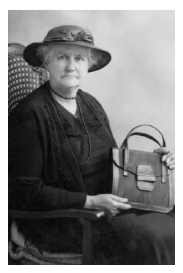
Rosie's Mum 10 June 1943

Now that I'm old I look back and see, just how selfish young people can be.