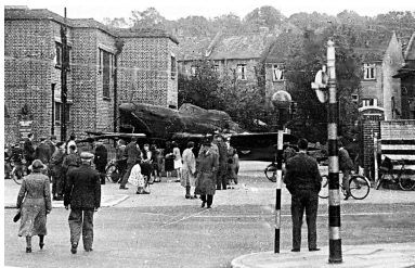
Spitfire fundraising by Coulsdon Library

Coulsdon Library , heart of the community since 1936. Photo shows WWII Spitfire fundraising nearby. Continue to Station Approach. Opposite stood Coppard's Temperance Hotel (1891-1934) at corner of Lion Green, former site of cricket matches and prize fights.