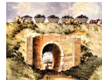
Horse-drawn wagons on CM&GIR crossing the bridge at Chipstead Valley Road, Coulsdon Watercolour by G B Wollaston, 1823. Courtesy of Croydon Public Libraries

View embankment of the CM&GIR (Croydon Merstham & Godstone Iron Railway) c.1805-1830 at rear of car park. This iron tramway took building materials to Wandsworth.