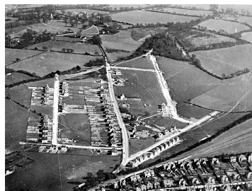
Aerial photograph of Marpit Lane development c.1925

From here a view of Marpit Lane can be seen. Compare with this aerial photo taken in its early development phase in the 1920s.