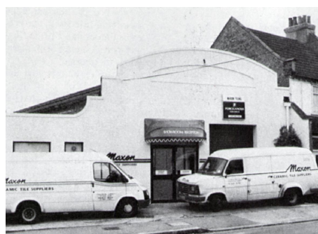
The former Palladium Cinema in 1989

Retrace route to Malcolm Rd and proceed downhill to the tile shop opposite Waitrose car park .