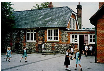
Former Smitham Infants School 1990

Turn left to the Teddies Nursery School .