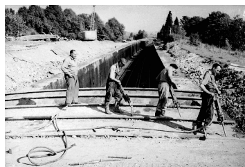
Removing the cover over the Quarry Line, 1954

Coulsdon South Station (renamed 1923) was opened in 1889 as Coulsdon Station, then renamed Cane Hill & Coulsdon in 1896. The fast Quarry Line entered the grounds of Cane Hill just north of the station, in what was a covered cutting until 1954. Note Bourne Society blue plaque.