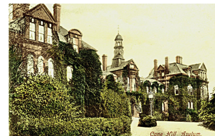
Cane Hill Asylum From a postcard courtesy of Roger Packham

Turn right (west) at signpost by clump of trees (originally 6 beeches planted 1760), leaving the London Loop. Proceed downhill to Downs Road, turn left, then via Woodplace Lane to Brighton Road. Cross at lights and turn right. Proceed north for 1000m past roundabout, to Farthing Way. Take first path left off bypass, up steps, then left to FP744. Proceed uphill to minor diversions of FP around fence to Portnalls Road. Stop and cross to pavement with care.