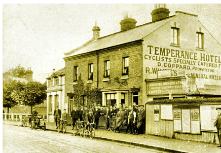
Coppard's Temperance Hotel c.1910 From a postcard courtesy of Roger Packham

Coulsdon Library , heart of the community since 1936. Photo shows WWII Spitfire fundraising nearby. Continue to Station Approach. Opposite stood Coppard's Temperance Hotel (1891-1934) at corner of Lion Green, former site of cricket matches and prize fights.