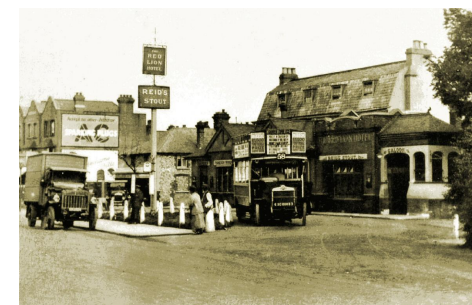
The Red Lion, Coulsdon c.1920

Return via Farthing Way pedestrian bridge to Edward Road . Continue via Victoria Road to Brighton Road . Turn left past public conveniences to site of an Inn on the left.