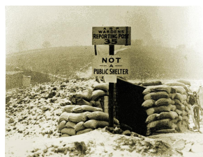
ARP Warden Reporting Post No.35, off Chaldon Way

Turn right (west) at signpost by clump of trees (originally 6 beeches planted 1760), leaving the London Loop. Proceed downhill to Downs Road, turn left, then via Woodplace Lane to Brighton Road. Cross at lights and turn right. Proceed north for 1000m past roundabout, to Farthing Way. Take first path left off bypass, up steps, then left to FP744. Proceed uphill to minor diversions of FP around fence to Portnalls Road. Stop and cross to pavement with care.