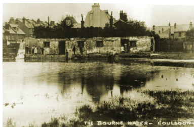
The Bourne Flood at Coulsdon in 1904 From a postcard

Site of Bourne Floods (pictured in 1904) and later water works pumping station. The Red Lion PH is in centre background.