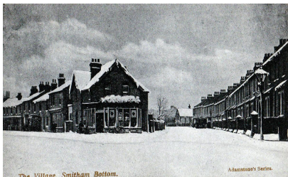
Chipstead Valley Road at Brighton Road c.1904

Start facing The Pembroke PH (formerly the Co-op), at 12-16 Chipstead Valley Road CR5 2RA, Smitham Bottom/Coulsdon town centre. Bldg near National Dining Rooms in WWII, and prior to 1914 a row of terraced houses with shops opposite, on land purchased from the Byron estate.