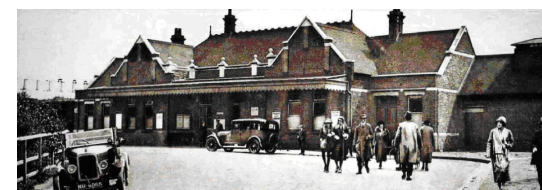
Coulsdon North Station 1928

Proceed up footpath to pedestrian bridge over railway to viewing point looking south to trading estate, near site of former rail terminus.