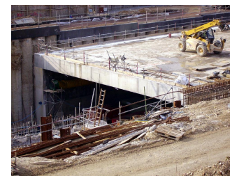
Box Tunnel under Smitham Station under construction

Smitham Station was opened 1904. Major alterations in recent years. Name change to Coulsdon Town is due in 2011. Longest box tunnel in Europe built in 2005/6 takes the A23 under the station.