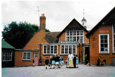
Former Smitham Primary School 1990

Continue to junction, then right to corner of Malcolm Rd .