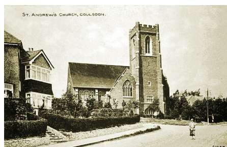
St Andrew's Church

Continue to corner of The Avenue . View church on opposite corner.